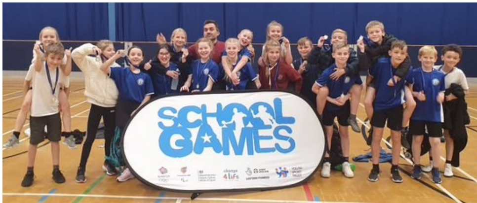
Table Tennis Bonanza

This means our team are now through to the COUNTY FINAL in February- well done everyone!